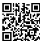
St. Paul's Website

If you have a name you would like to include on the prayer list, or a ministry event that you would like to announce in this printed bulletin, please send information to announcements@stpaulscary.org . Names included in the prayer list will remain for a month, and we are happy to extend at your request. Please note that there is a 2-week lead time on printed announcements.