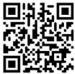
St. Paul's Website

If you have a name you would like to include on the prayer list, or a ministry event that you would like to announce in this printed bulletin, please send information to announcements@stpaulscary.org . Names included in the prayer list will remain for a month, and we are happy to extend at your request. Please note that there is a 2-week lead time on printed announcements.