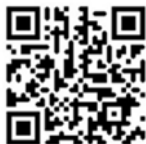
St. Paul's Website

If you have a name you would like to include on the prayer list, or a ministry event that you would like to announce in this printed bulletin, please send information to announcements@stpaulscary.org . Names included in the prayer list will remain for a month, and we are happy to extend at your request. Please note that there is a 2-week lead time on printed announcements.