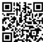
St. Paul's Website

If you have a name you would like to include on the prayer list, or a ministry event that you would like to announce in this printed bulletin, please send information to announcements@stpaulscary.org . Names included in the prayer list will remain for a month, and we are happy to extend at your request. Please note that there is a 2-week lead time on printed announcements.