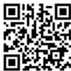
St. Paul's Website

If you have a name you would like to include on the prayer list, or a ministry event that you would like to announce in this printed bulletin, please send information to announcements@stpaulscary.org . Names included in the prayer list will remain for a month, and we are happy to extend at your request. Please note that there is a 2-week lead time on printed announcements.