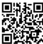
St. Paul's Website

If you have a name you would like to include on the prayer list, or a ministry event that you would like to announce in this printed bulletin, please send information to announcements@stpaulscary.org . Please note that there is a 2-week lead time on printed announcements.