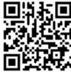
St. Paul's Website

If you have a name you would like to include on the prayer list, or a ministry event that you would like to announce in this printed bulletin, please send information to announcements@stpaulscary.org . Please note that there is a 2-week lead time on printed announcements.