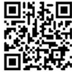
St. Paul's Website

If you have a name you would like to include on the prayer list, or a ministry event that you would like to announce in this printed bulletin, please send information to announcements@stpaulscary.org . Please note that there is a 2 week lead time on printed announcements.