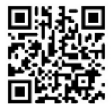
St. Paul's Website

If you have a name you would like to include on the prayer list, or a ministry event that you would like to announce in this printed bulletin, please send information to announcements@stpaulscary.org . Please note that there is a 2 week lead time on printed announcements.