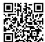
St. Paul's Website

If you have a name you would like to include on the prayer list, or a ministry event that you would like to announce in this printed bulletin, please send information to announcements@stpaulscary.org . Please note that there is a 2 week lead time on printed announcements.