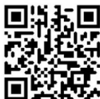
St. Paul's Website

If you have a name you would like to include on the prayer list, or a ministry event that you would like to announce in this printed bulletin, please send information to announcements@stpaulscary.org . Please note that there is a 2 week lead time on printed announcements.